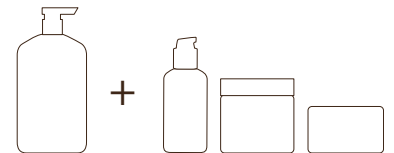
Boosting skincare and supplement products